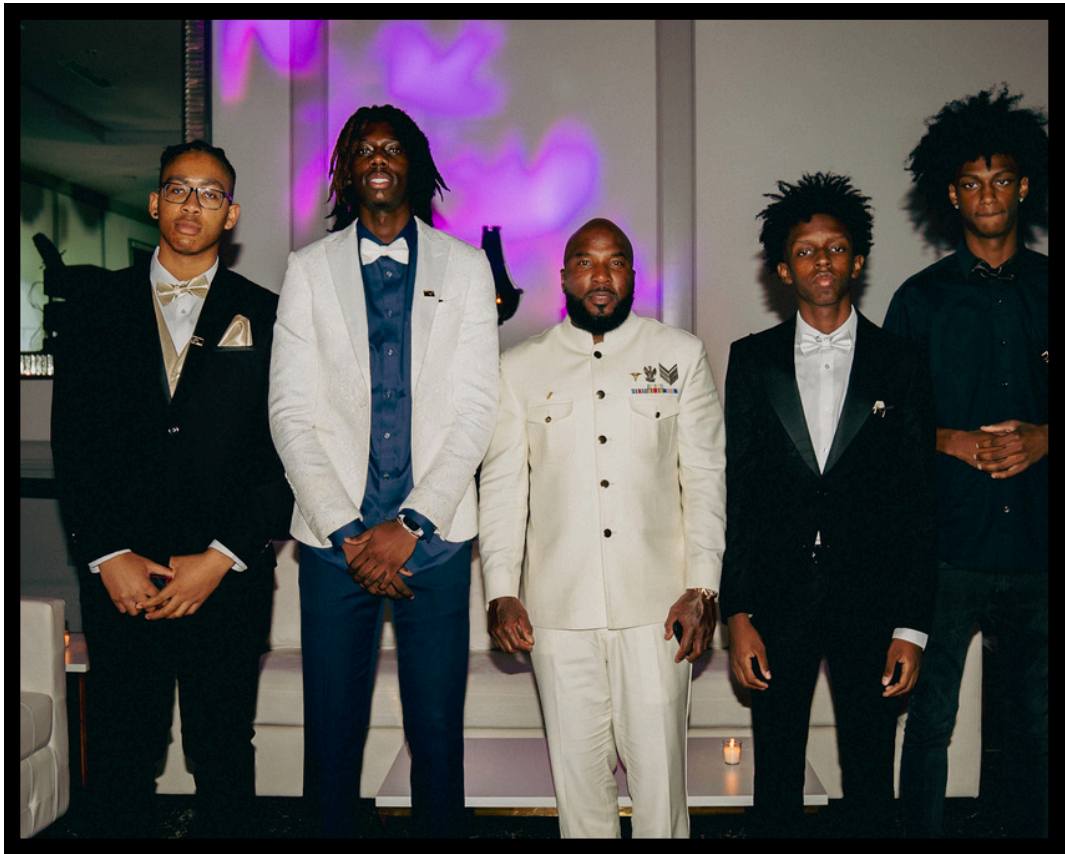
Jay "Jeezy" Jenkins and kids of the Street Dreamz Foundation