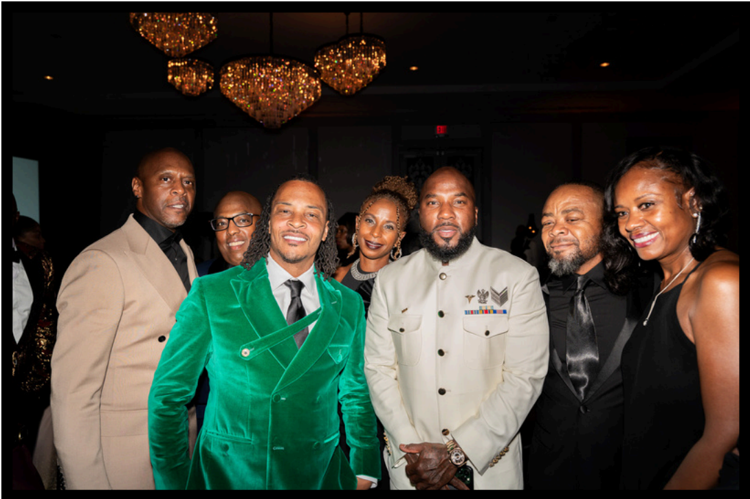
TIP "T.I." Harris, Jay "Jeezy" Jenkins and other supporters