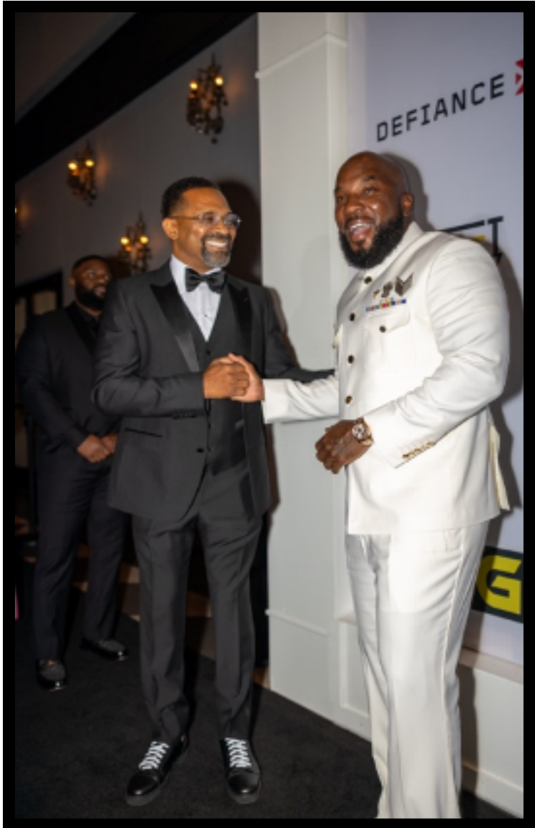
4th Annual Host Mike Epps and Jay "Jeezy" Jenkins